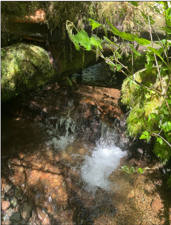
Figure 2.–Small waterfall, looking upstream at waypoint 627.