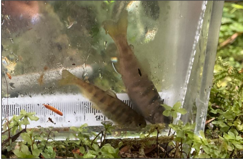
Figure 1.–Juvenile coho salmon caught at waypoint 626.