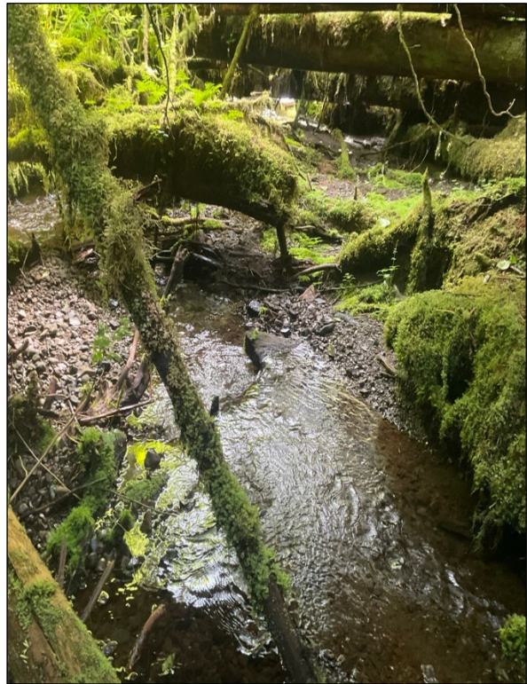
Figure 3.–Channel at waypoint 625, looking downstream.